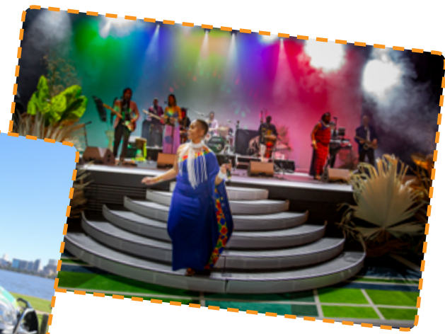
Pictured from left: Mission 32, The ambulance sent to Tanzania, Rafiki Ball 2019.