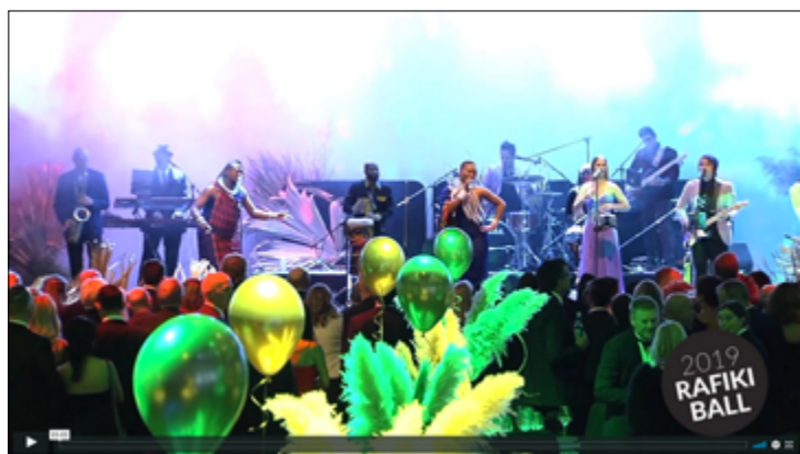
Watch the 2019 Rafiki Ball Video here