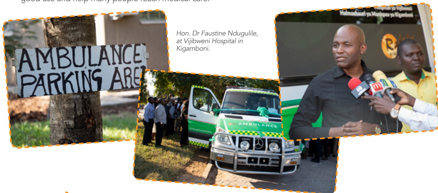
Hon. Dr Faustine Ndugulile, at Vijibweni Hospital in Kigamboni.

This is fourth ambulance that ATS has donated to Tanzania and the first of many Mercedes class ambulances that will be donated to different areas in Tanzania over the next 12 months. We are sure that they will be put to good use and help many people reach medical care.